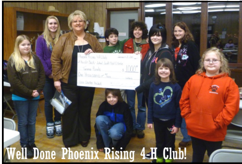
Well Done Phoenix Rising 4-H Club!